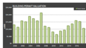
* The Top 10 Permits table includes permits with the highest project completion cost issued to date, both commercial and residential

From 2017 to 2018, total building square footage is projected to decrease by 64.4%, (4,275,853, ft. vs. 1,520,445 ft.). The value of building permits is projected to decrease by 30.9% ($154,111,321 vs. $106,449,752). The table below and map on page 3 show the Top 10 Permits by valuation.